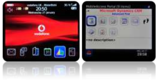
Seamless integration with Blackberry (above) and Outlook (below)